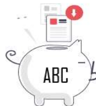
Transfer of Credits