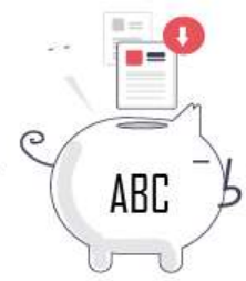
Transfer of Credits